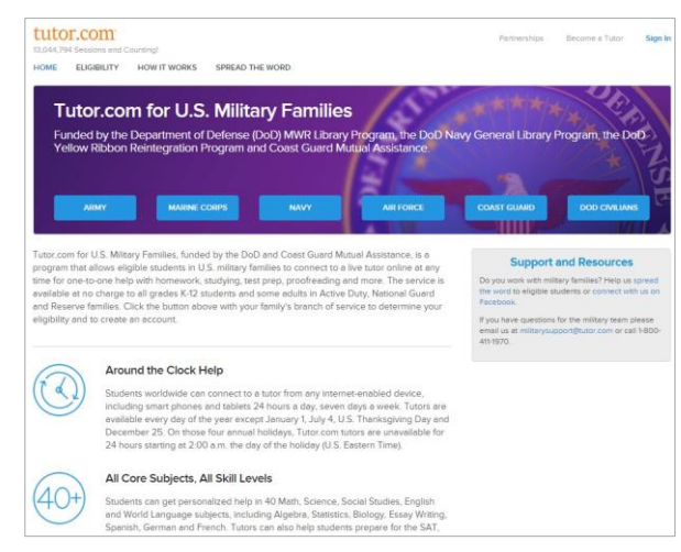
Students go to www.tutor.com/military and click the blue button showing their branch of service to get a tutor.